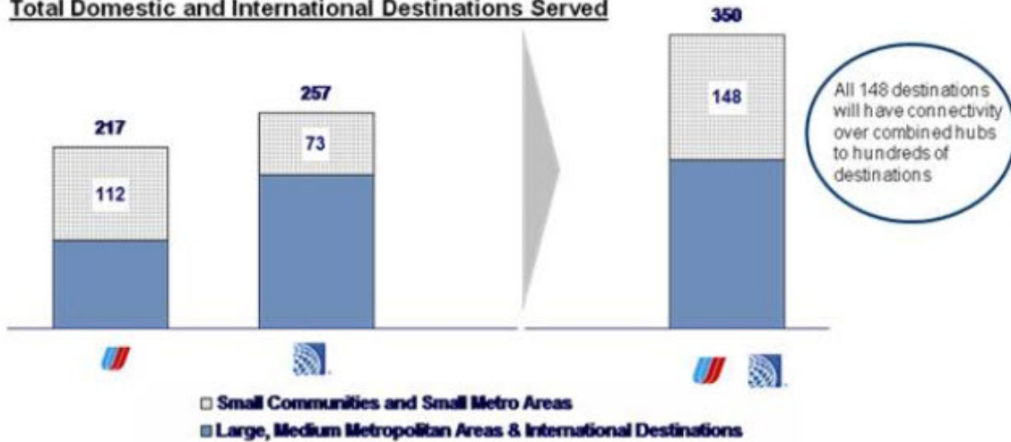
Total Domestic and International Destinations Served