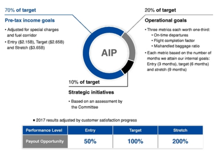
Modifier of 0% to 150% based on individual performance

2017 Annual Incentive Awards. The graphic below outlines the key elements of the 2017 annual incentive awards.